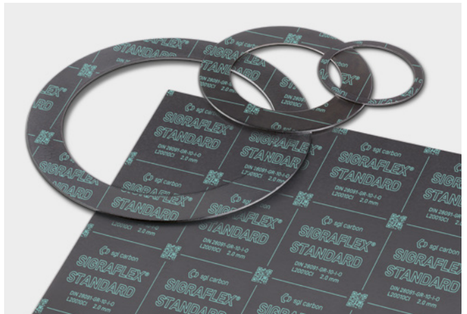
↑ SIGRAFLEX STANDARD sealing sheets and gaskets