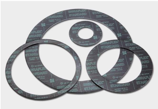
↑ Gaskets made from SIGRAFLEX STANDARD